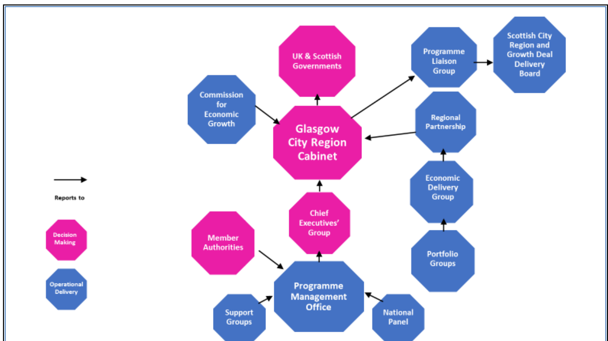
Figure 1: Cabinet Governance Structures